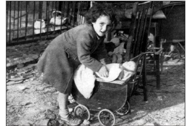
For young children caught up in the destruction of their home, toys had to be rescued. This little girl cares for her doll in its pram.