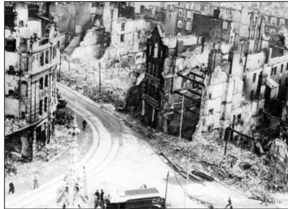
Spooners Corner and nearby building in ruins. Spooners store was where the first major fire was reported to have broken out on the first night of the Plymouth Blitz.