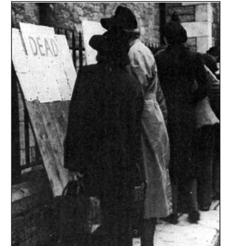
Examining the official casualty list. The names of the dead were placed on boards around the city.